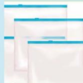
food storage bags