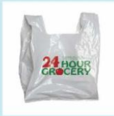
thick plastic bags