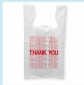
thin plastic bags