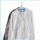
dry cleaning bags