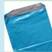
plastic shipping envelopes