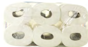
Bathroom Tissue, Napkin & Paper Towel Packaging

Recycling Locations: Kohl's • Kroger • Lowe's • Meijer • Target • Walmart