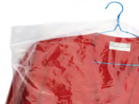
Dry Cleaning Bags